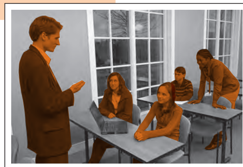
Social skill autopsy